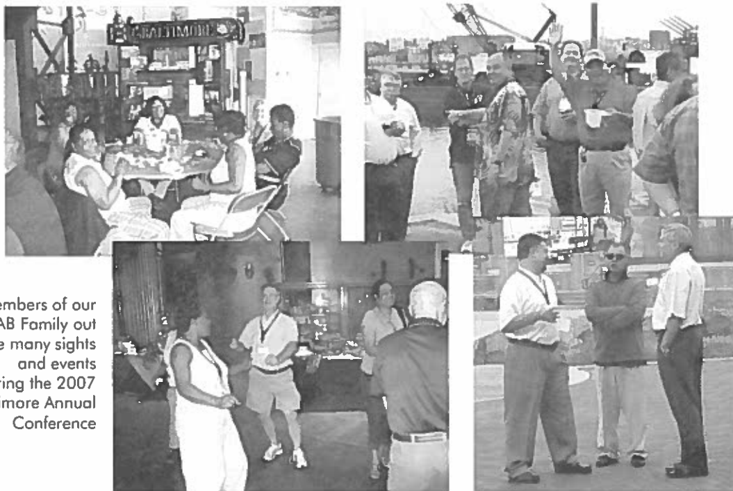
Members of our NAUIAB Family out enjoying the many sights and events during the 2007 Baltimore Annual Conference